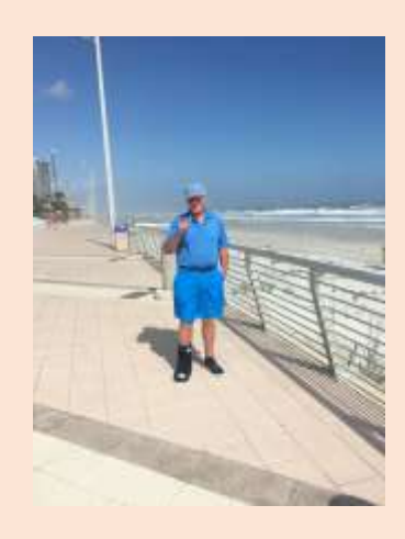
Booted on the Boardwalk