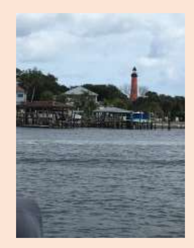
Ponce Inlet Lighthouse