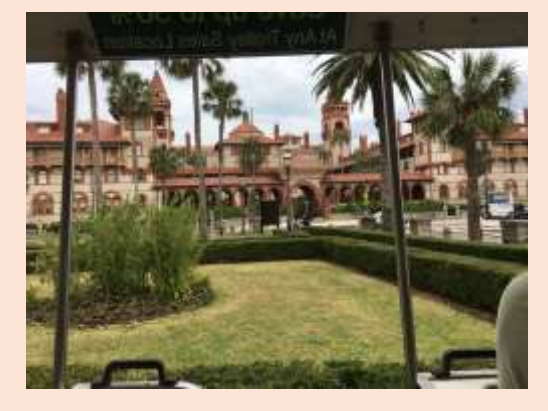
Flagler University, St Augustine