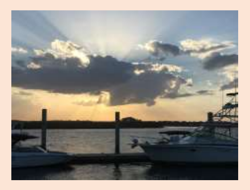
Sunset on the Intra Coastal Waterway